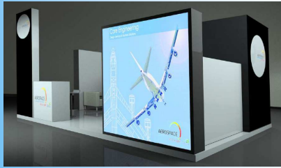
This picture is subject to modifications

300 companies 6 000 BtoB meetings 20 countries represented