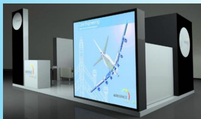
This picture is subject to modifications

375 companies 9,000 BtoB meetings 28 countries represented